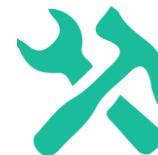
Industrial & Mechanical