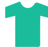
Apparel & Textiles