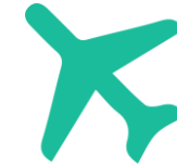
Exporters & Importers